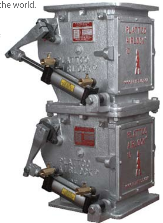
Pneumatically Operated H-Series Valve

Housing is not part of the seal -- allowing it to last for decades in the worst operational environments.